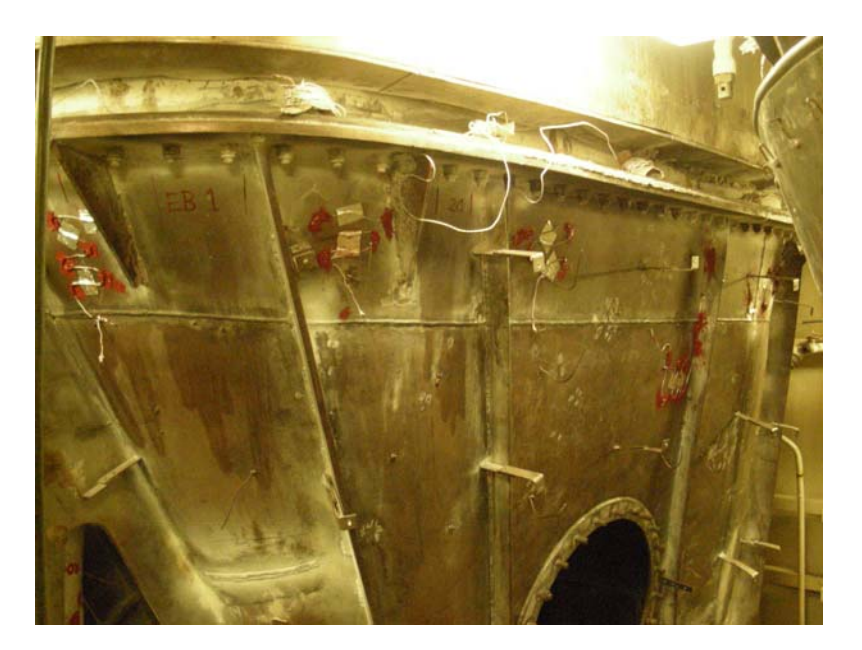
Figure 3. Thermocouples installed in the duct

With purpose of getting experimental values of temperature and velocities in the real system one of the ships using this turbine was monitored. Six thermocouples were installed in the local where cracks occur, Fig.3, and the exit velocity was measured using one pitot tube in the outlet of the exhaust duct.